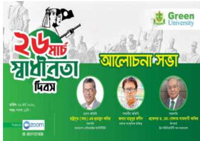
Photo: Celebration of Independence Day, 2022

c. Annual Picnic of Green University Lawyers Association (GULA) was held at Zinda Park, Purbachal on 1 April, 2022.