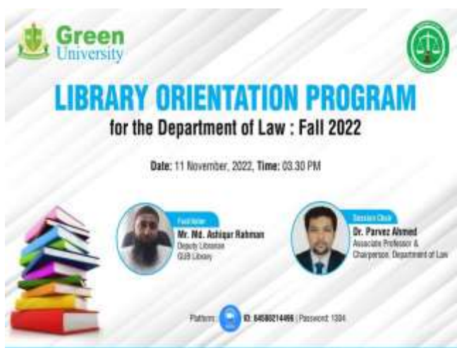
Photo: Library Orientation Program, Fall 2022