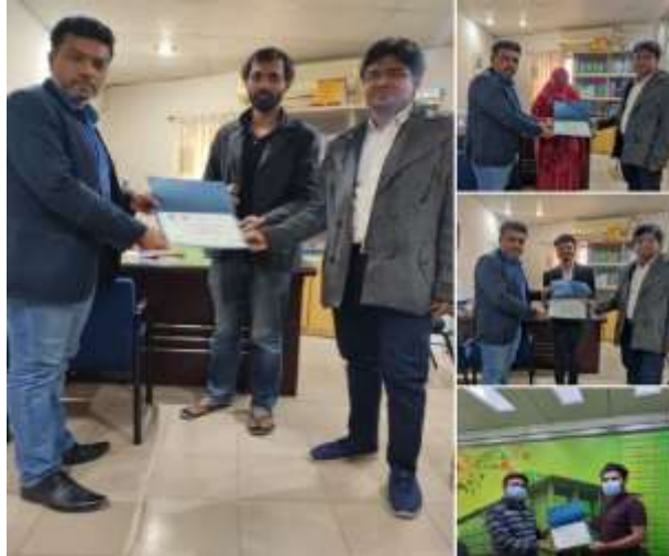
Photo: Participation in the Pre-Jessup Workshop Session