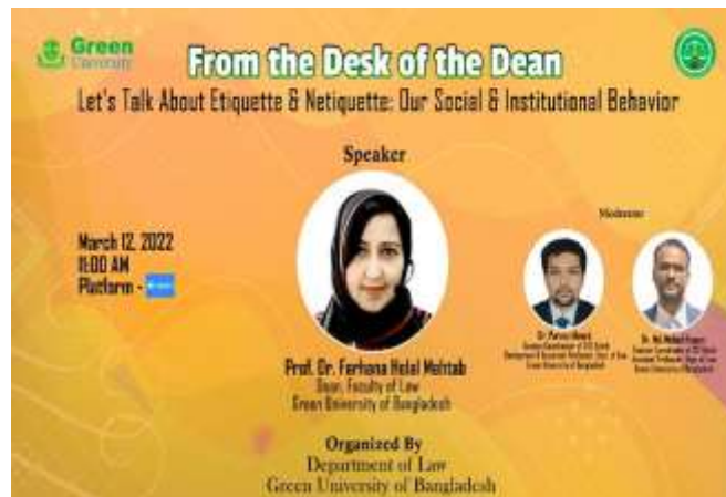
Photo: Series Discussion 'From the Desk of the Dean'