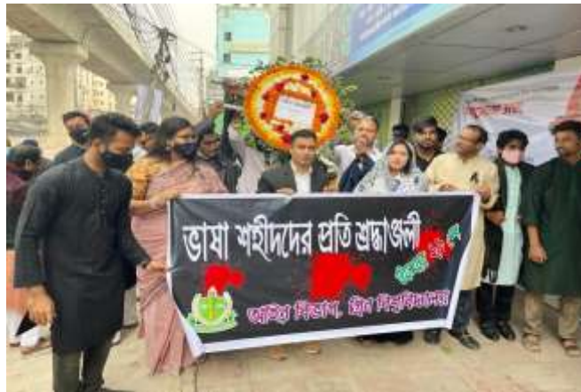
Photo: Celebration of International Mother Language Day

a. GUB Law celebrated International Mother Language Day on 21 February 2022.