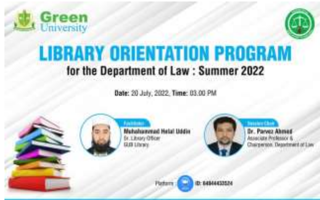
Photo: Library Orientation Program, Summer 2022

c. GUB Law organized 'Library orientation program' in collaboration with GUB Library at 3 pm on 20 July 2022. Link: https://bdren.zoom.us/j/64844433524