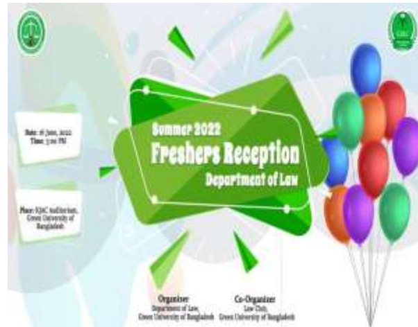
Photo: Fresher's Reception, Summer 2022